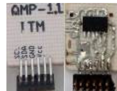
Fig. 3: Back and front view of MEMS sensor.

The MEMS used gives the measurements in digital form, through a serial interface I2C or SPI, which can be chosen by software. Fig. 3 shows a picture of the MEMS used, mounted on the printed circuit. The size of this board is of 1 x 0.8 cm, with a mass of less than 20 g, and therefore in a practical form, it is not affecting the total mass of the net and it is not changing the ability of the net to move with the touch of the ball