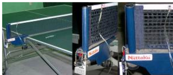
Fig. 5 System mounted on the net assembly.

Any time during the service when the ball touch is detected, the indicator light will stay turned on, although the auxiliary umpire stops pressing the switch, and it only will be turned off pushing and releasing the switch twice in a row. This sequence was chosen to avoid accidental erasure of the indicator, when naturally the umpire stops pressing the switch after the return of the service.